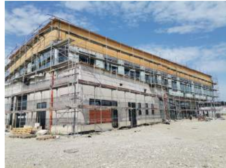
Technology park in Ormož under construction